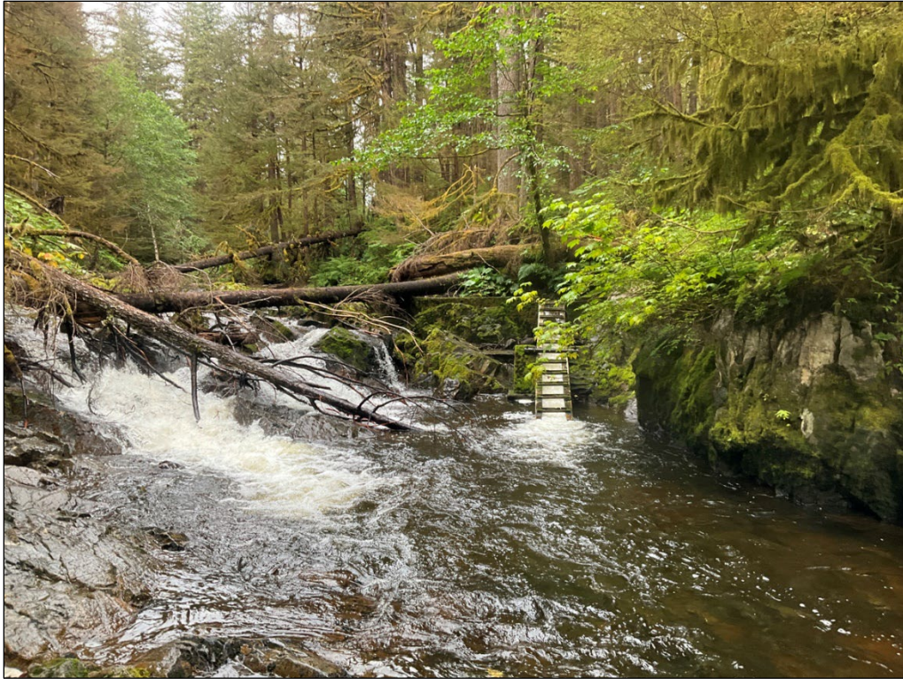
Figure 1.—Fish pass at waypoint 1483.