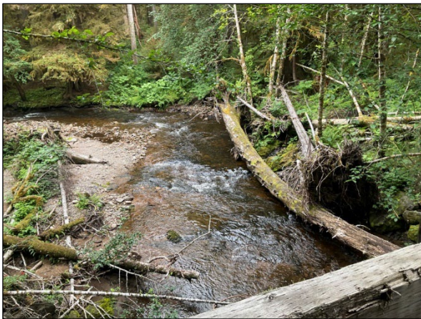
Figure 2.—Channel at waypoint 1308