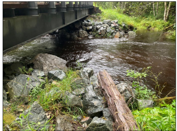
Figure 3.—Channel at waypoint 1437